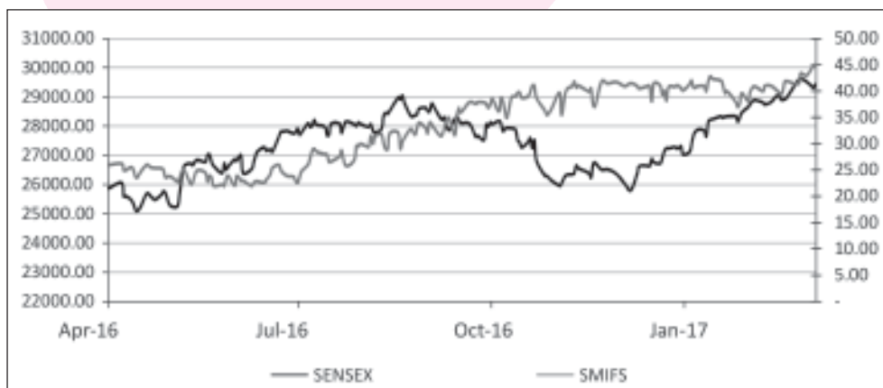
Share price comparison chart of Equity Shares of the Company vis-à-vis BSE Sensex